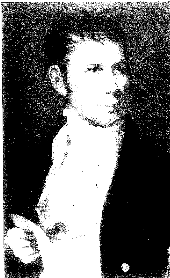
Henry Clay, Speaker of the House.

While American leaders tried to respond to the manipulations of Britain and France so that they could maintain rights to conduct trade, domestic politics changed significantly. In the elections of 1810, voters sent many young westerners to Congress. The new Congress chose Henry Clay, a young Kentuckian, as Speaker of the House.