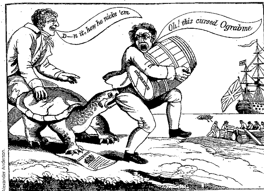
The adverse effect of the embargo is shown in this cartoon. "Ograbme" is embargo spelled backwards.

days before the end of Jefferson's administration, the Nonintercourse Act of 1809 forbade all trade with both France and Great Britain as well as their colonies. However, the act also allowed the president to reopen trade with whichever belligerent nation removed its restrictions on U.S. trade first. This act opened American ports to all other traders, (though most of U.S. trade had been with Britain and France), and encouraged smuggling. Any captain simply had to announce that his ship was engaged in coastal trade within the