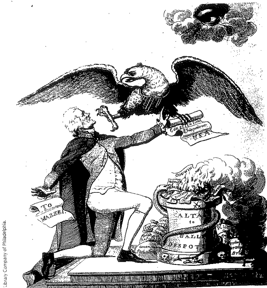
This Federalist cartoon, "The Providential Detection," portrays Jefferson as overly sympathetic to France.